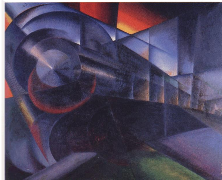
Ivo Pannaggi Speeding Train 1922