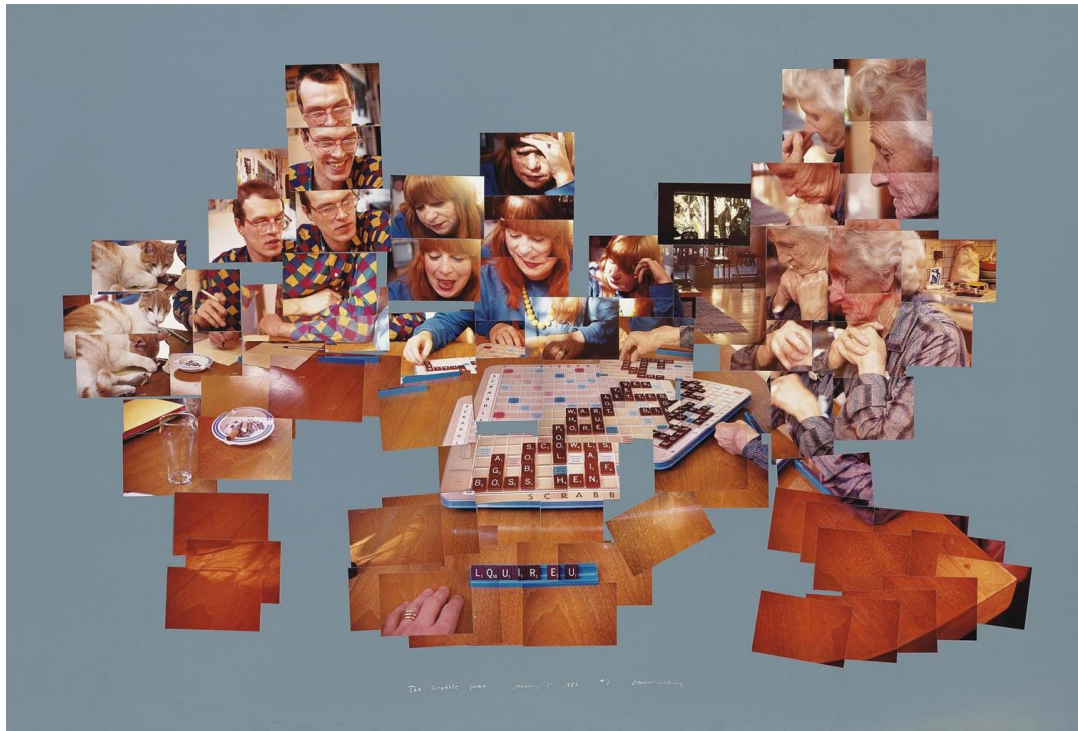
David Hockney The Scrabble Game, Jan. 1 1983 1983